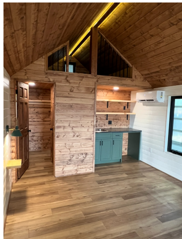
Efficient mini split heating and cooling