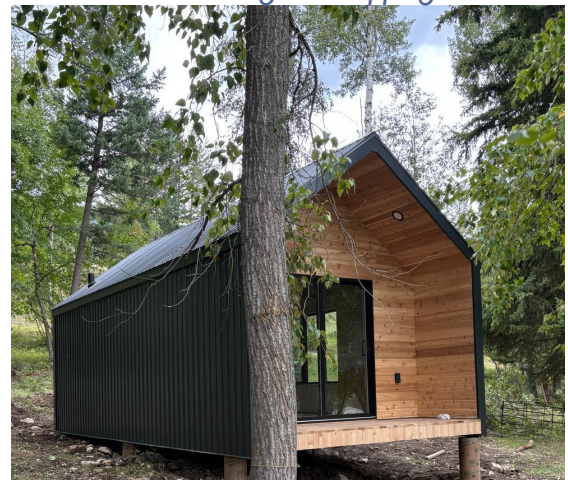
Your cabin Placed on your foundation type: - concrete piers - screw piles - skids on gravel base