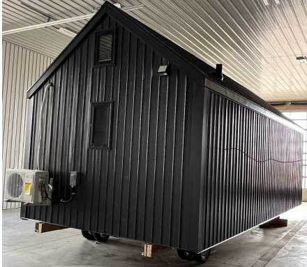
Spray foam insulated to handle Canadian winters