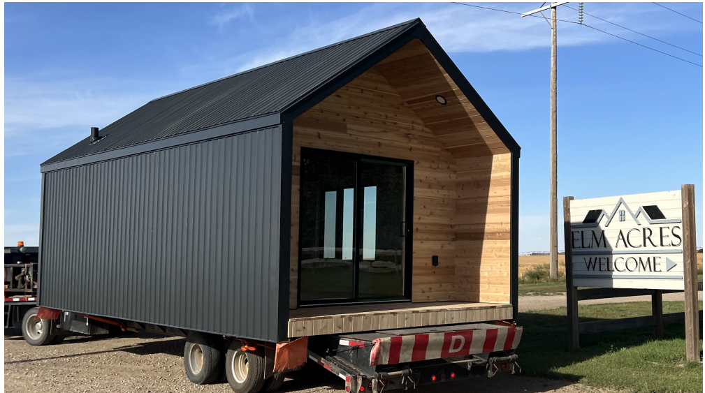
Delivery Cost as per location We arrange the shipping