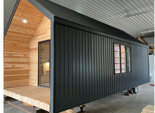
Production Metal exterior Cedar deck & surround